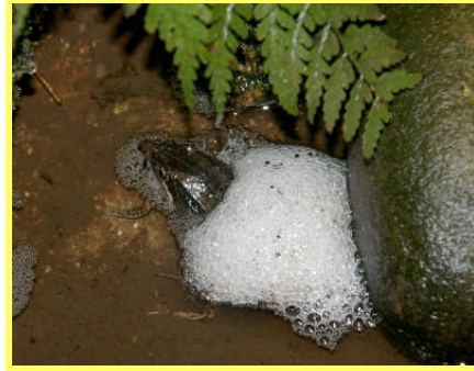
Striped Marsh Frog