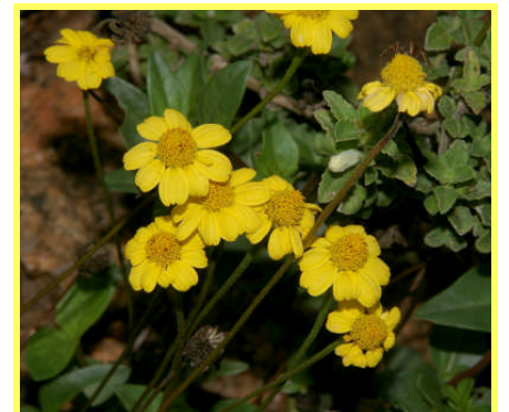
Wedelia sp. Herberton