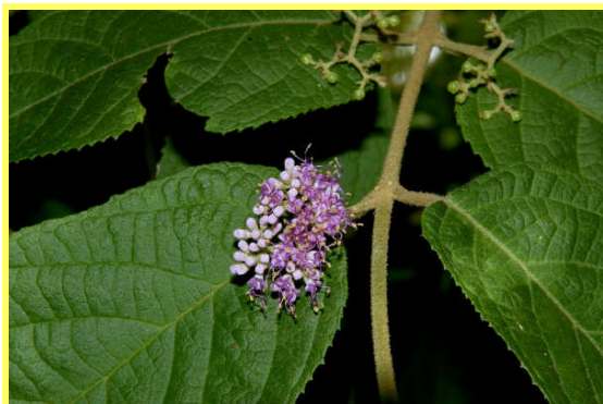
Callicarpa sp. Mt Edith