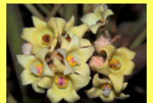
Argyrodendron sp. Whyanbeel