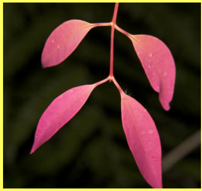
Acmena sp. Stockwellia site

The heavy rain during and following the cyclone really saturated the soil and because of this most plants are continuing to push out new growth. Usually at this time of the year the garden is looking dull and lifeless, but not this year.