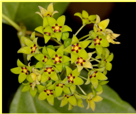
Heterostemma sp. Bellenden Ker