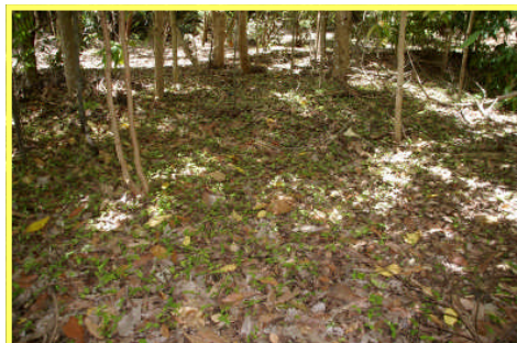
Argyrodendron sp. Whyanbeel