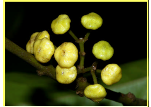
Wilkiea sp. Lockerbie