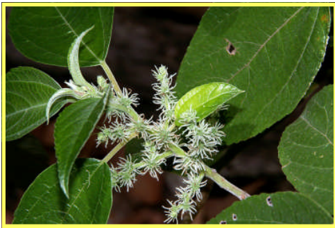
Pipturus sp. Archer Ck