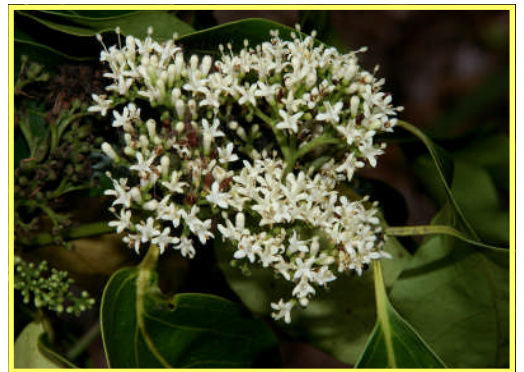
Psydrax odorata Central Qld var.