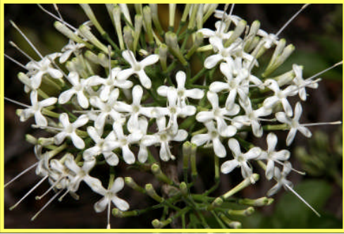
Pavetta australiensis var. pubigera