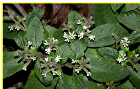
Ophiorrhiza australiana subsp heterostyla