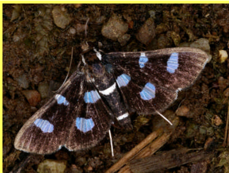
Moth (Any ideas?)