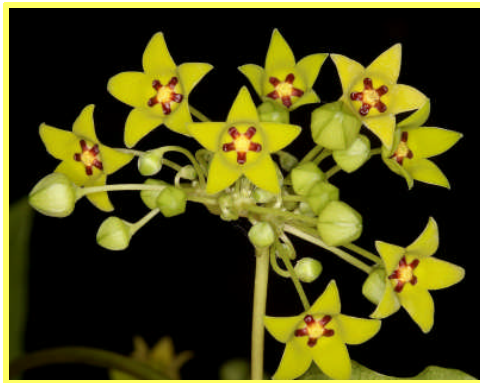
Heterostemma sp. Bellenden Ker