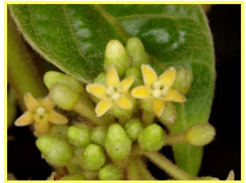
Gymnema sp. near Paluma