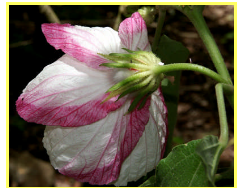
Hibiscus sp. Townsville