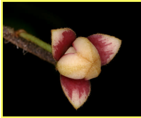
Haplostichanthus sp. McDonnell's Ck