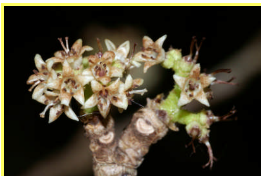
Ehretia sp. Possum Scrub