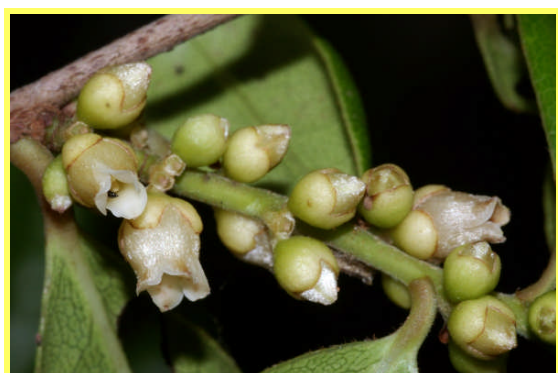
Diospyros sp. Mt White