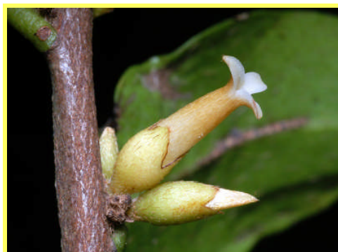
Diospyros sp. Bamaga