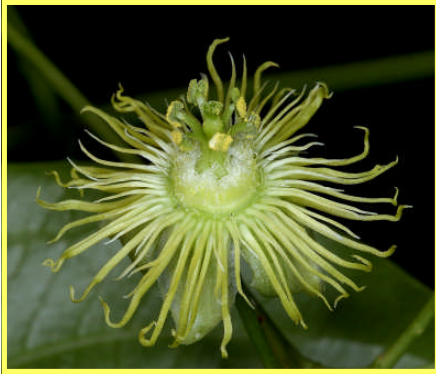
Passifloraceae sp. Kuranda