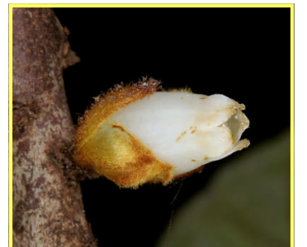
Pouteria sp. Barong