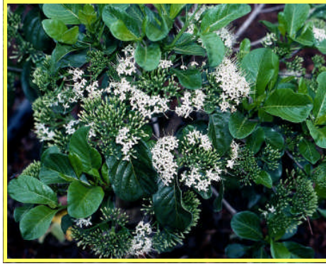
Pavetta sp. Muddy Bay