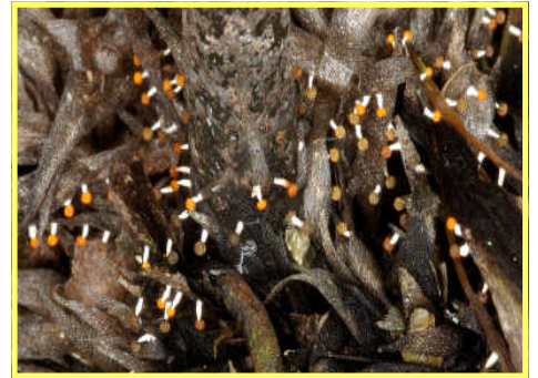
Tiny fungi on base of Asplenium