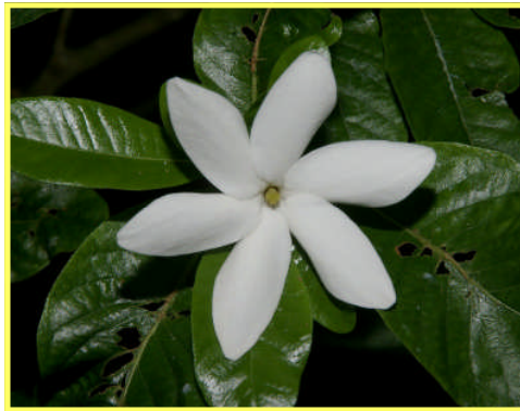
Gardenia sp. Weipa