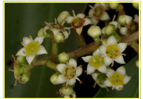
Geijera sp. Chillagoe