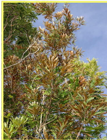
Grevillea baileyana var. Iron Range