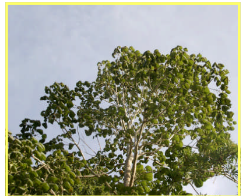
Gyrocarpus americanus subsp. sphenopteris