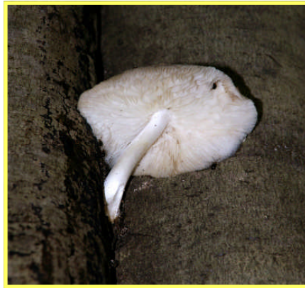
Fungus on Tricospermum